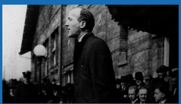
William Z. Foster

Labor United Educational League (LUEL) is a national center of trade unionists and unorganized workers, with the goal of strengthening the working class in the fight against imperialism and capitalist barbarism. We distribute a newspaper called Labor Today. We are class-oriented, democratic, independent, and modern, reflecting values of the international trade union movement.